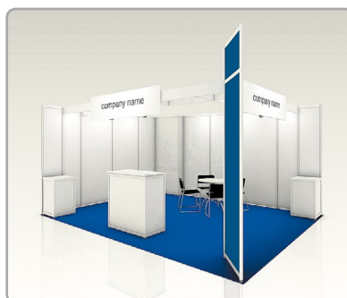
Shell scheme “Oslo”, on the left with basic equipment, on the right with additional furniture

Please order your “Space + Shell Scheme” package until 8 weeks before the start of the fair (17 April 2018) . Late orders will be subject to surcharges.